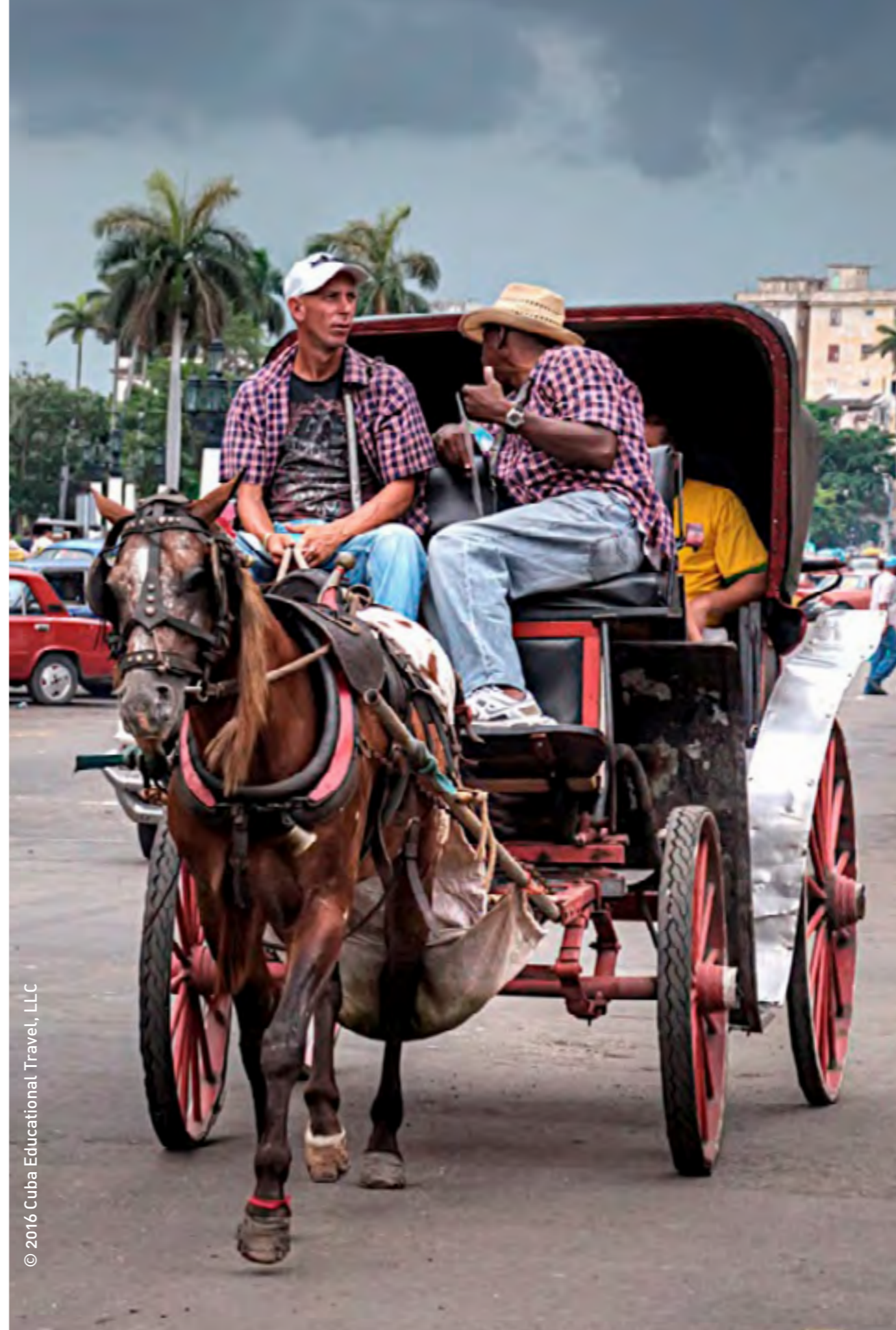
© 2016 Cuba Educational Travel, LLC

Please note that once you exit customs, you will need to check-in for your connection to your final destination.