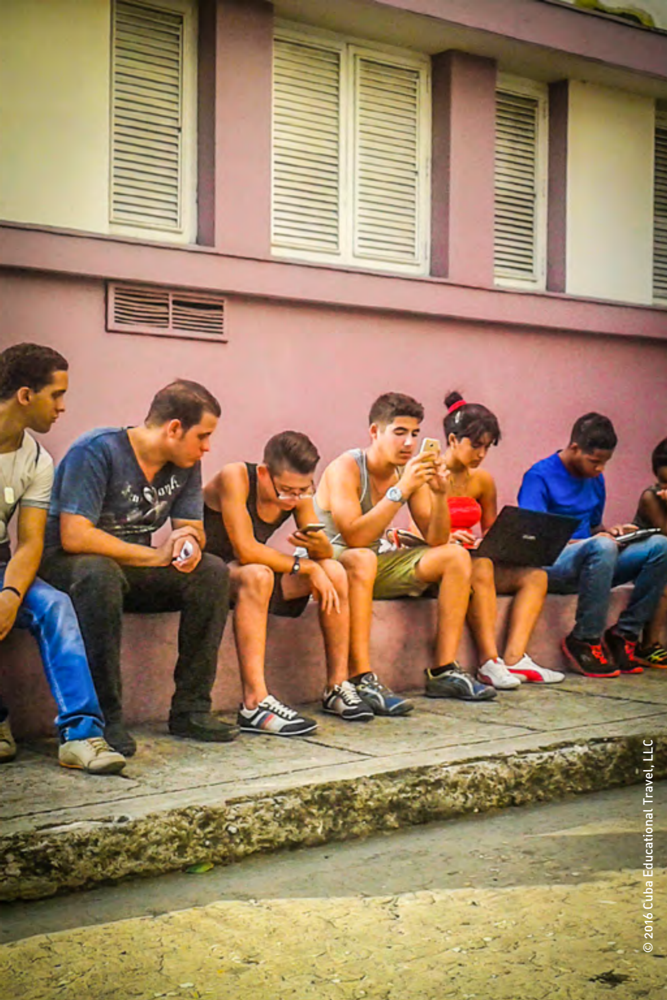
© 2016 Cuba Educational Travel, LLC